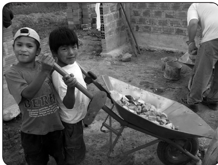
Right: Some of the boys at the internado in Ixiamas, Bolivia, pitch in to help build the new girls' dormitory and guest house.