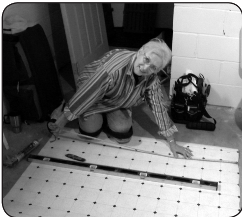
Left: NOMADS team members spent three weeks beginning our campground renewal project. From painting and cleaning to ceilings and grounds, the group left SIFAT much better than they found it.

For more information on NOMADS membership, visit www.nomadsumc.org .