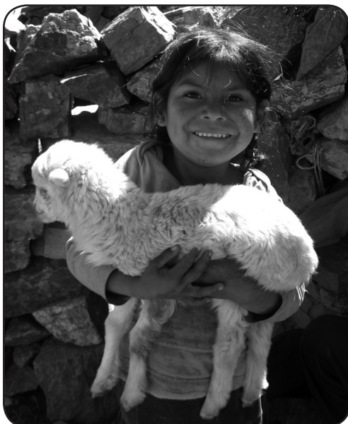
Left: A young girl in Quesimpuco, Bolivia, holds a lamb to be treated by a veterinarian team from Auburn UMC.

Engineers Without Borders from Auburn University will be sending an assessment team to Quesimpuco in August to formulate a five-year plan for a project to help the people in that area. They will be exploring options that will fit into their guidelines, including clean water and sanitation treatment possibilities. A medical/dental team from Texas A&M will arrive