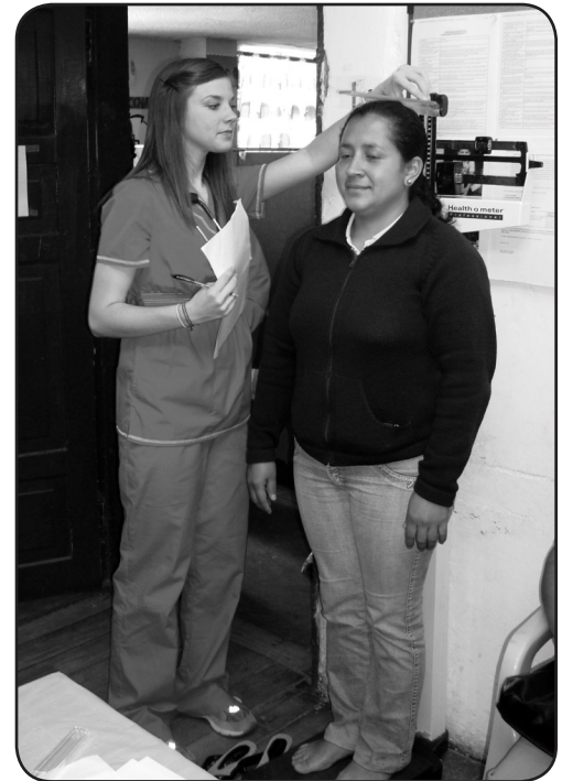
A nursing student from Auburn University weighs and measures one of the ladies coming to the women's medical clinic in Calderon, Ecuador. Medical teams in Ecuador serve at the project sites of graduates from the SIFAT Ecuador Practicum.

Expanding SIFAT's resources into these new areas is certainly a challenge for our small international staff. However, the opportunities and the needs are so great that we look forward to working on these new projects in each country, and to see what wonderful things God has in store for our STM teams in 2010.