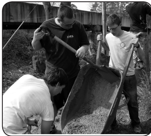
Right: Members of the University of West Georgia's Wesley Foundation mix and pour concrete while working on a project to irrigate the field across the creek from the cafeteria.