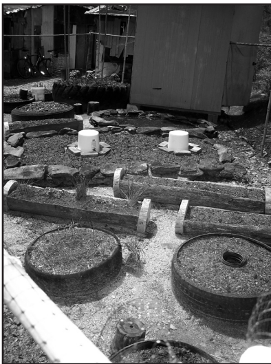
SIFAT gardener John Carr's urban garden is under development in SIFAT's simulated slum.

John has designed a rooftop/urban garden in the slums of our Global Village. There are three main types of rooftop gardens: shallow bed, shallow pool and wick. Hybrids of these types are often used, such as the ones John cultivated.