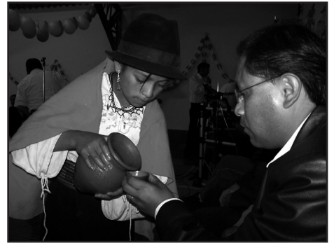
One of the young students in her native Quichua dress serves a homemade juice to those attending the service.