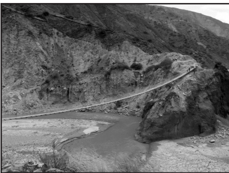
The river is about 100 feet below the bridge. In just a few short weeks, it will fill the valley and make crossing dangerous.