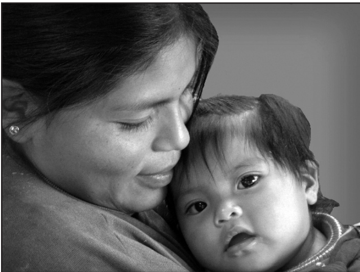
Photo: Taken by team leader Joyce Henderson on a mission trip in Cayambe, Ecuador, in Oct. 2008

Instead of focusing on what has been, let's focus on what can be. We know that simple, low-cost solutions are available to prevent these needless deaths. A few examples: