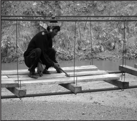
Attaching the decking was one of the last requirements to finish the bridge.