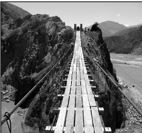
The bridge is approximately 400 feet long. Now, residents can safely cross the Chayanta River during the rainy season