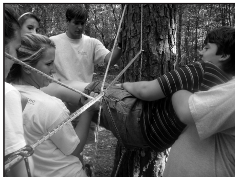
Students participating in Learn & Serve work together on the ropes course.

Appropriate technology was put into practice on Tuesdays when lunch was made using cookstoves. Thinking about appropriate technologies and having a little experience under their belts prepared everyone for Tuesday night, when a long hike and customs checkpoint led to the Village Experience.