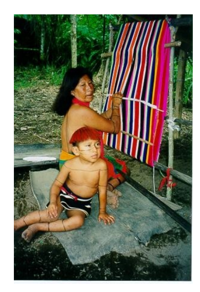
SIFAT students from the Tsachila Tribe in Ecuador have taken their training back