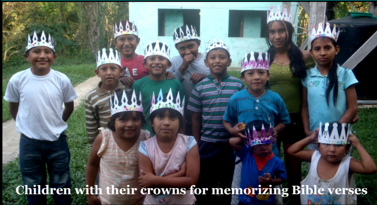
Children with their crowns for memorizing Bible verses

In 2012, we began a children's program called OANSA (AWANA in English) that met every Sunday afternoon. The children were awarded stickers as they memorized verses and for attendance. It was