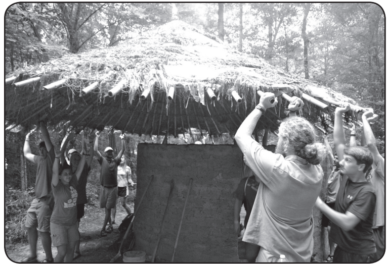
L&S youth participants help SIFAT summer staff put the roof on the Nigeria house. We now have two houses representing Nigeria in the Global Village!