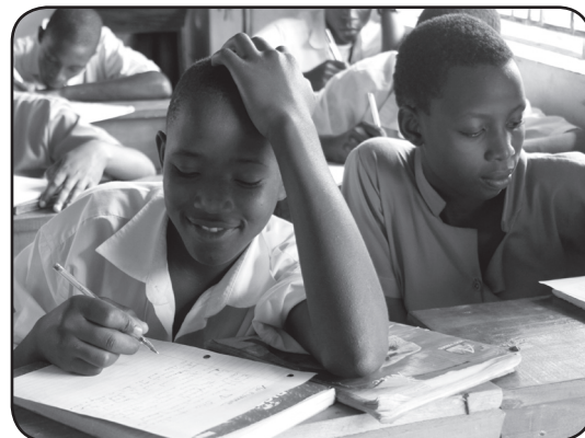
Agape Christian Academy needs a boys' dormitory!