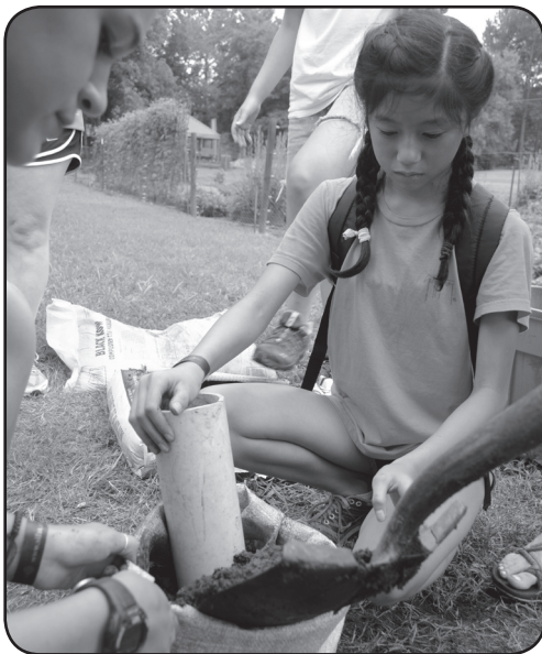
L&S students learned to build fuel-efficient stoves and sack gardens in their appropriate technology training this summer.