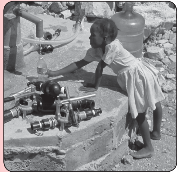
A young girl does not worry about getting cholera when she drinks water from one of the purification systems our water teams installed in Haiti.