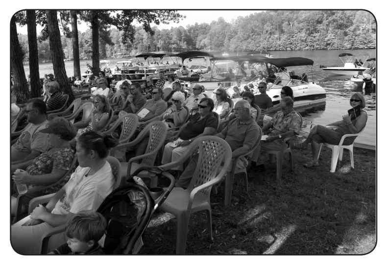
Almost 2,500 people attended SIFAT-sponsored worship services on Lake Wedowee this summer. Worship on the Water (WOW) meets weekly from Memorial Day weekend through Labor Day weekend.

For the past five summers, Learn & Serve participants have served in our local community. In addition to the County Road 88 project, they helped the Ashland Street Department, Clay County Health and Wellness Center, Get 'n' Buy, Lineville Nursing Home and Will's Way.