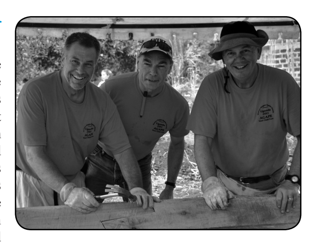
Members of the Western Heights Baptist Church team prepare to roof one of the buildings at Agape Total Childcare Center's new property in Uganda.

One of the main questions people ask when you are organizing an expensive mission trip like this is, "Wouldn't our money be