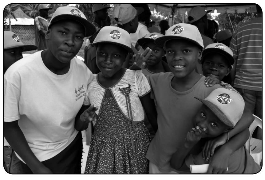
Four of the children living at Agape Total Childcare Center in Uganda stop for a photo during a picnic with the first SIFAT team. The team roofed one of the buildings at the new property for the orphanage and future school, held VBS for the children and worked on other construction projects.

of the necessary tools with us and ordered the supplies to be delivered locally. The condition of the wood we had to use for the beams was somewhat warped, to say the least. To be perfectly honest, this wood would have been tossed to the burn pile in the U.S., so I think we were all a bit skeptical from the outset. However,