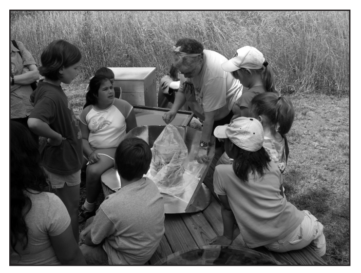
Students learn how to cook using solar energy for heat. Alternative fuel sources and fuel-efficient cookstoves are important subjects in appropriate technology.

Designed for third through twelfth grades, Appropriate Technology focuses on meeting our basic human needs with what is available to us. Students explore how to get what you need if you lack money, electricity or access to stores.