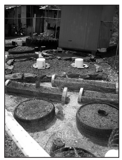
SIFAT gardener John Carr's urban garden is under development in SIFAT's simulated slum.

John has designed a rooftop/urban garden in the slums of our Global Village. There are three main types of rooftop gardens: shallow bed, shallow pool and wick. Hybrids of these types are often used, such as the ones John cultivated.