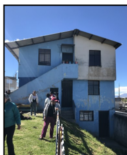
The new construction will be 10 m wide by 15 m long and fit on the steeply sloped green area adjacent to the existing building