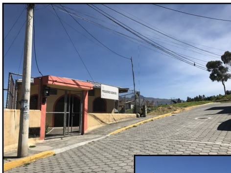
Above: Street view of Iglesia Bautista Esperanza Eterna