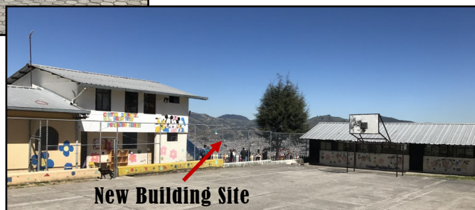
New Building Site