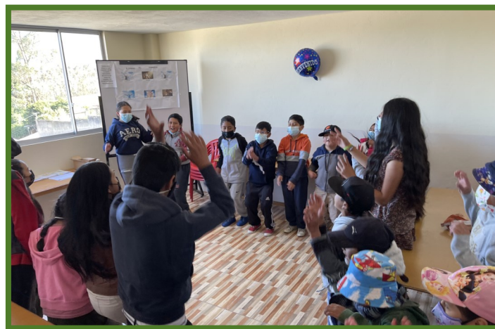
Songs and Bible verses were shared by each class.