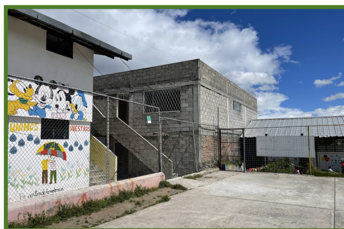
The new building in Aida Leon may lack paint on the outside, but the inside is full of bright colors and happy voices!